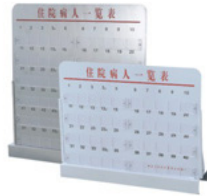
HX-102 住院病一览表 (60位)