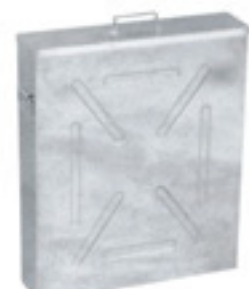
HX-126 不锈钢X光片定显影桶 (洗片桶)

SPECIFICATIONS: (mm) 8L (Ø205×280) 10L 12L 20L 25L