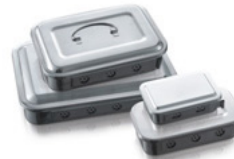
HX-113 不锈钢消毒盘 (带侧气孔)

HX-106 Stainless steel case history holder