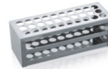
HX-128 不锈钢试管架 (卷边)

SPECIFICATIONS: (mm) Ø400×160 Ø360×140 Ø32×130 Ø26×120 Ø24×110 Ø22×100