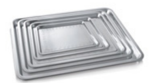
HX-118 不锈钢方盘 (薄型卷边)

SPECIFICATIONS: (mm) I 290×190×50 II 400×300×28 III 310×240×31