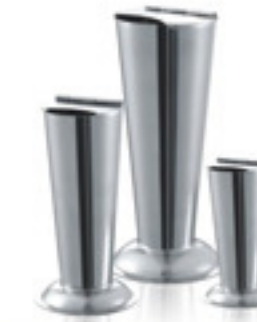
HX-111 不锈钢镊子筒 (倒锥型)

SPECIFICATIONS: (mm) Ø 80, Ø 90, Ø 100, Ø 120