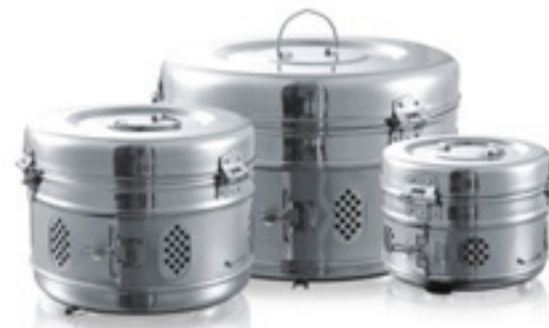
HX-109 不锈钢贮槽 (拉伸型)

· 规格: (mm) Ø 170, Ø 200, Ø 230, Ø 260, Ø 300