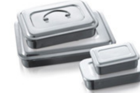
HX-114 不锈钢消毒盘 (无孔)

SPECIFICATIONS: (mm) 290×190×50 (11.5") 230×150×50 (9") 200×11×48 (8") 140×90×48 (6")