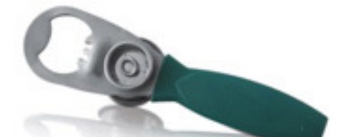
HX-132 塑柄不锈钢开瓶器

HX-132 Plastic handle stainless steel bottle opener