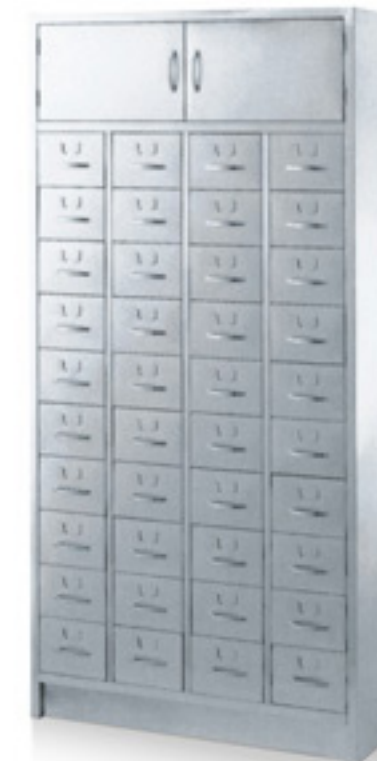
HX-H23 不锈钢立式中药柜 (40抽)