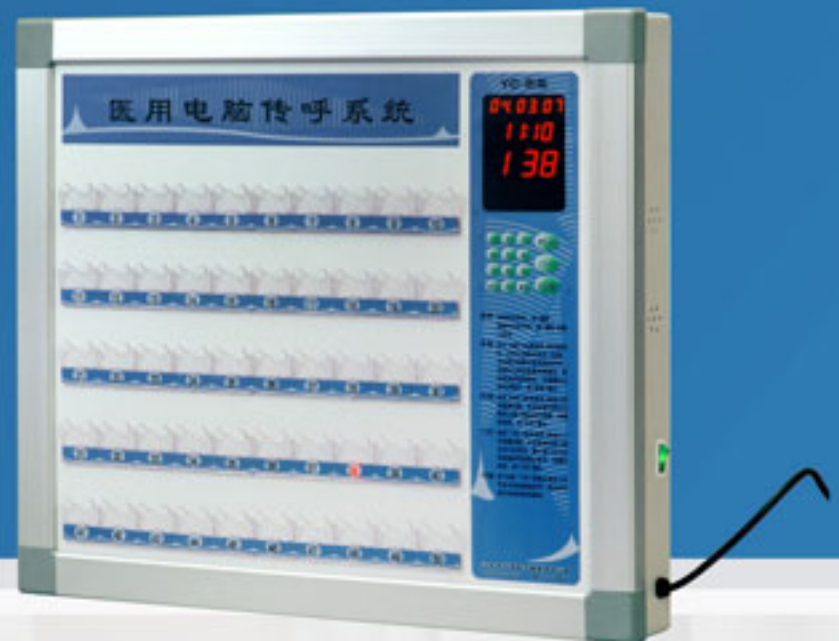
YC-B Digital indication single-way nurse call system