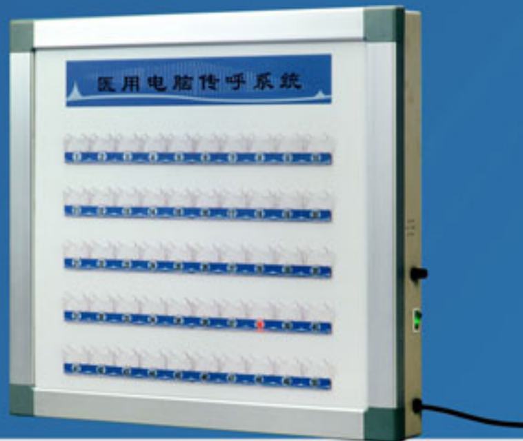
YC-A Single-way nurse call system