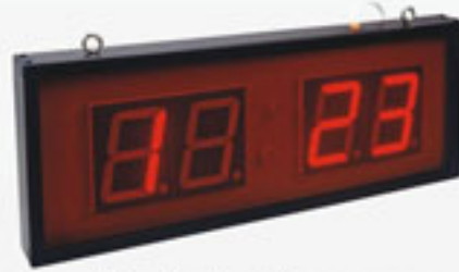
II type corridor indication screen with clock