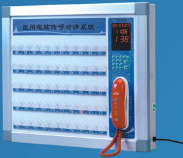
YC-C Double-way nurse call system