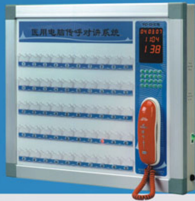
YC-D Multi-function & double-way nurse call system