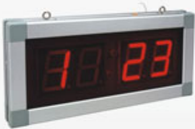
I type corridor indication screen with clock